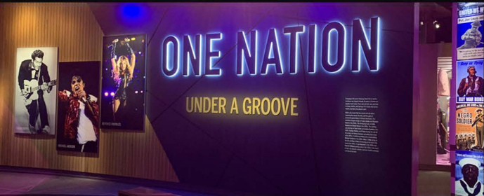
ONE NATION UNDER A GROOVE

The Wade in the Water gallery documents the history and influence of African American religious music, including spirituals and gospel music.