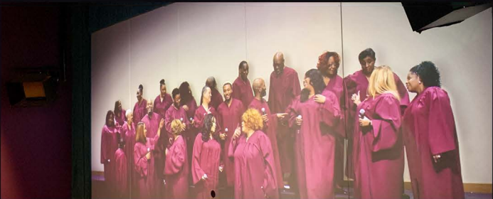
WADE IN THE WATER

The Rivers of Rhythm corridor is the central spine of the museum experience and features touch panel interactives and an animated timeline that links American history and American music history.