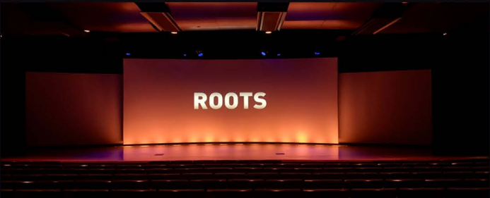
THE ROOTS THEATER

The Message gallery chronicles the history and impact of hip hop and rap music on pop culture in the U.S. and around the world.