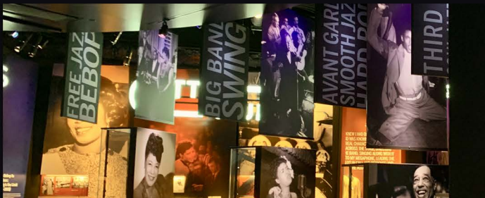
A LOVE SUPREME

Visitors will get an overview of African American history with specific emphasis on the creation of distinct African American musical traditions that grew out of specific historical and social contexts.