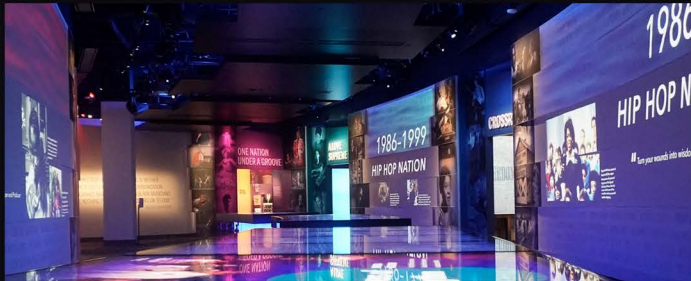
RIVERS OF RHYTHM

A Love Supreme gallery tells the story of jazz, the quintessentially “American” style of music that carries some of the most deeply embedded African American music and cultural elements of any form of music.